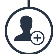
NUMBER OF CONTRACTING OFFICERS THAT HAVE SIGNED THESE CONTRACTS