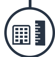
PERCENTAGE AWARDED TO SMALL BUSINESSES