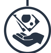
AVERAGE SMALL BUSINESS CONTRACT SIZE