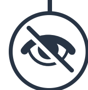
PERCENTAGE OF AWARDS THAT WERE NOT AVAILABLE FOR BID AT SAM.GOV