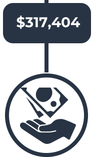
AVERAGE SMALL BUSINESS CONTRACT SIZE