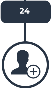
NUMBER OF CONTRACTING OFFICERS THAT HAVE SIGNED THESE CONTRACTS