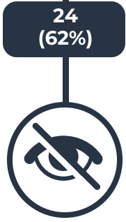
PERCENTAGE OF AWARDS THAT WERE NOT AVAILABLE FOR BID AT SAM.GOV