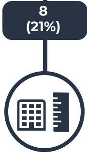
PERCENTAGE AWARDED TO SMALL BUSINESSES