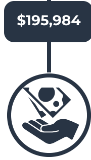
AVERAGE SMALL BUSINESS CONTRACT SIZE