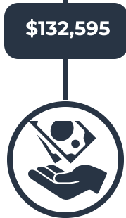
AVERAGE SMALL BUSINESS CONTRACT SIZE